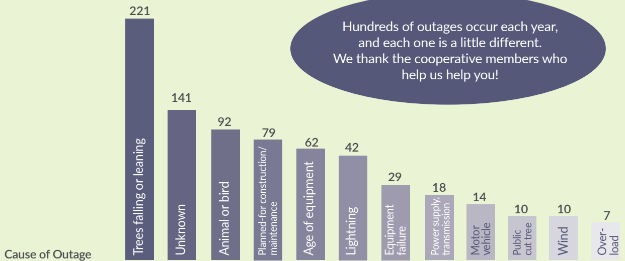
Number of Outages

Hundreds of outages occur each year, and each one is a little different. We thank the cooperative members who help us help you!